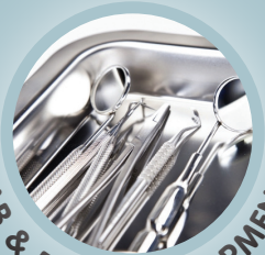
LAB & DENTAL EQUIPMENT